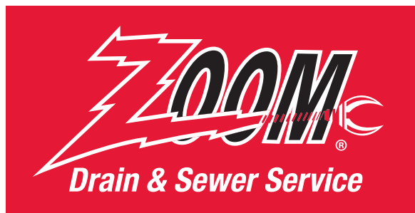
Zoom_Alt = For use on red backgrounds