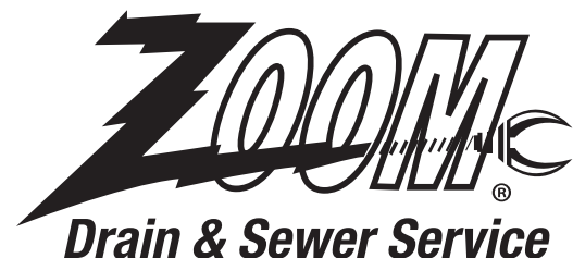
Zoom_B_W = One color & Black and white only.